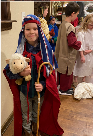
Feast of Lights